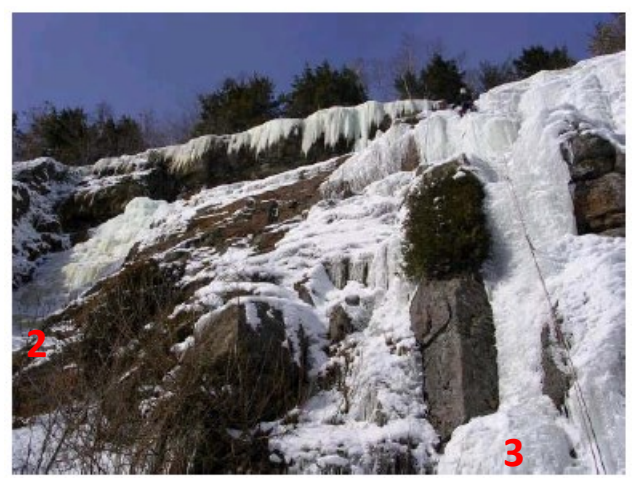
Case O'Beer, photo Yann Troutet, Guide des cascades de glace et voies mixtes du Québec

The main waterfall of the area. Very reliable, but on the other hand, be very careful at the end of the season because it is known to fall all at once! Rappel down to the right. There is a bolted belay on climber's right at about 60m, and slings on trees at the top.