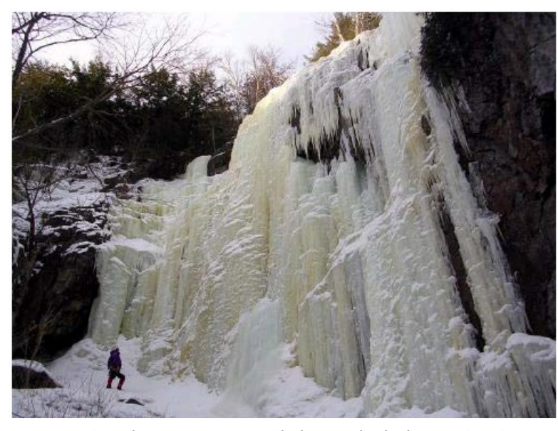
1 Les Trois Vices, photo Yann Troutet, Guide des cascades de glace et voies mixtes du Québec