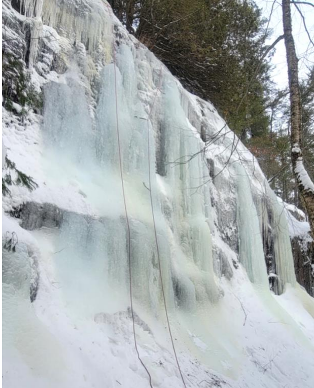
Short but enjoyable lines on the Right Side.