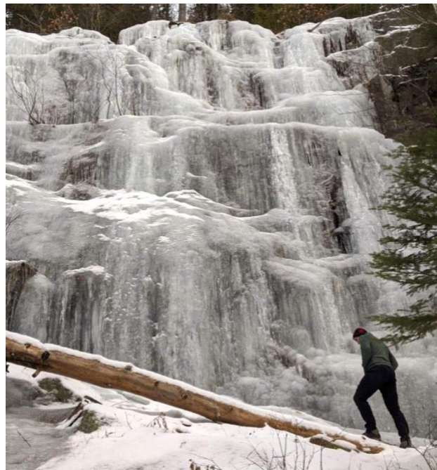
The Left Side in thin shape but growing rapidly.