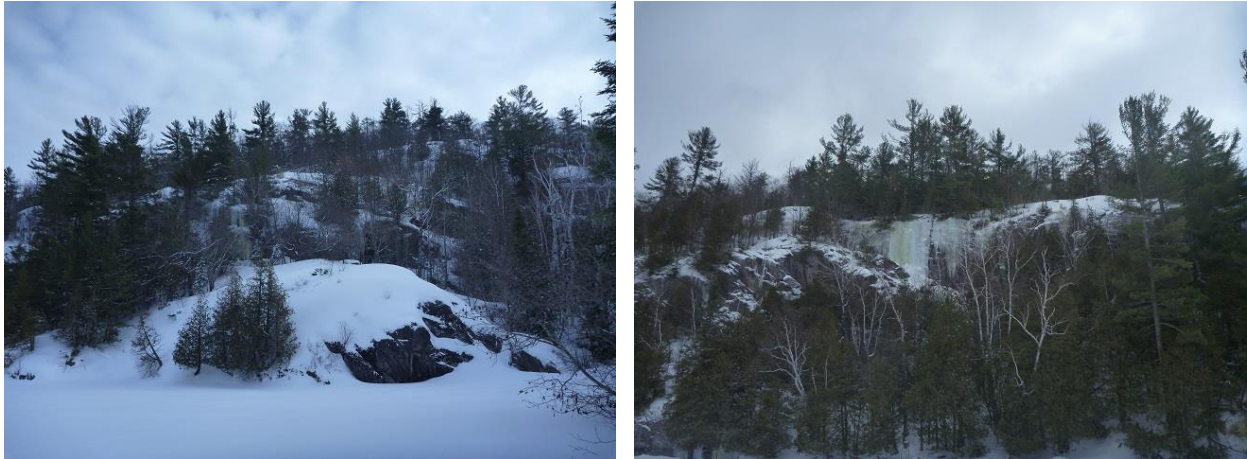
Left: The Bandicoot/Serenity Ledge. Right: Wet Baguette viewed from the lake.

The next climbs are located 75 m north/left of Porcupine Corner on a higher ledge system.